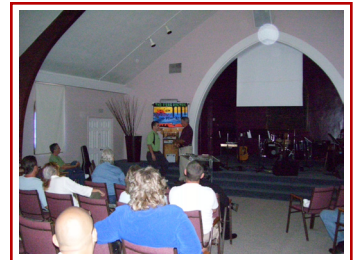
Evangelism Training Session at Bethany Chirstian Fellowship