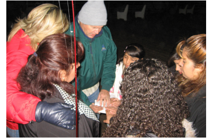
Prayer for Salvation

The answer is clear, the souls of men, women, boys and girls. The Scripture is very clear about what God thinks is important. "That which is good, and pleases God our Savior, is that He wants all men to be saved and to come to a knowledge of the truth". 1 Timothy 2:3-4 That is why we have given our lives to fulfill the Great Commission. We are following our Father's heart desire to see people saved and going to heaven rather than lost and going to hell.