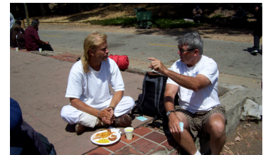
Sharing Jesus Over Salvation Army Meal

your not going to impact the world for Jesus Christ at all. In fact people will be turned off. But if you simply abide in Him and allow the Spirit of God to do the initiating, your fruit will remain and people will be blessed.