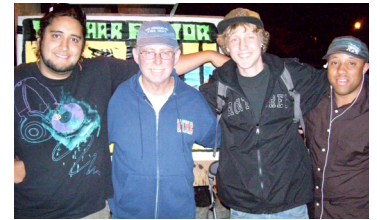
4 Young Men who Came to Christ

only do those things that the Father tells us to do. This life is not meant for us promote ourselves and be pleasing to man. Our Father's opinion of us is the only one that really counts.