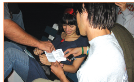
SHOWING THE WAY WITH A GOSPEL BOOKLET