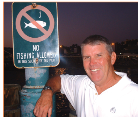
SATAN'S GREAT COMMISSION

We have the cure to the worst disease in the history of mankind: worse than leprosy, heart disease, leukemia, rabies, TB, multiple sclerosis, arthritis and AIDS. The disease in sin and every human being is infected with a deadly case of it! The only cure is the blood of Jesus Christ and faith in His death, burial, resurrection and obedience to His gospel. We have the glorious responsibility and privilege of taking His heart medicine to our sick world!