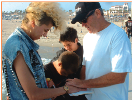
C. C. BEACH SIDE OUTREACH